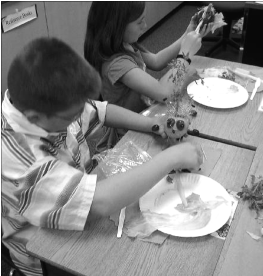
Ruth Clark Elementary fourth graders in Emily Chandler's class got creative with vegetables and fruit during Earth Day activities on April 21.