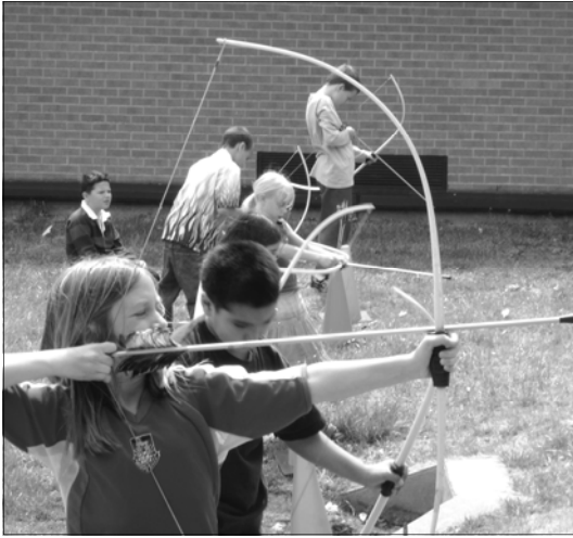
Freeman PE students took advantage of the Spring weather to sharpen their archery skills.